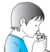
Using the nosepiece (optional)