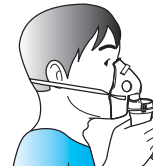
Using the adult mask (PVC)