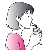
Using the mouthpiece