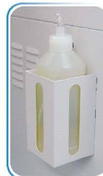
AutoOiler - Automatically pumps oil onto the cutting blades