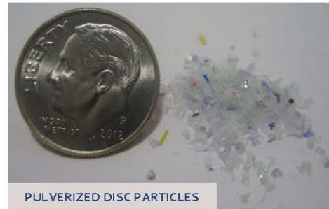
PULVERIZED DISC PARTICLES