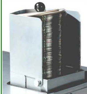
Below, 200-Disc AutoLoader and media destroyed by the MD-OMD