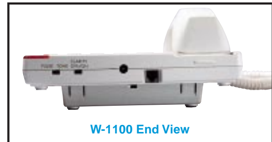
W-1100 End View