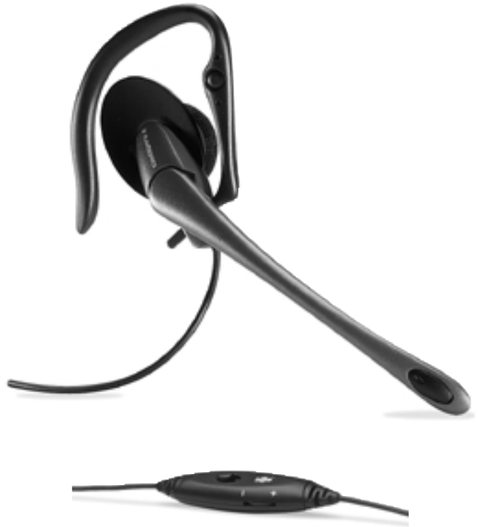
Easy volume and mute control (available on M135)