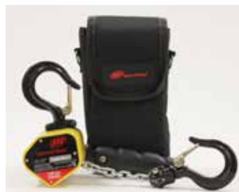
Carrying bag is included with all KX lever hoists.