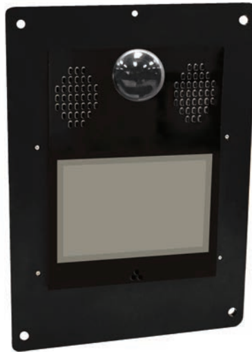
Part #: 7200

The SmartView 2 Elevator Unit is a combined audio and visual communication system providing complete ADA compliance within the elevator car. The unit comprises of a display, camera, microphone, and speaker all within one compact housing. The SmartView 2 Elevator Unit also has inputs for the emergency call button and yes / no buttons to allow a trapped passenger to answer text messages that are displayed on the screen. Note: The 7100 Machine Room Unit is required to complete the installation of this unit.