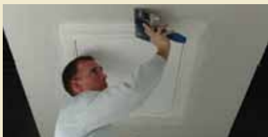
4. Tape and apply drywall compound.