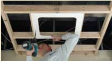
2. Mount Stealth surround with drywall screws.