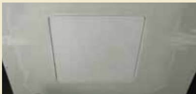
5. Apply desired finish.