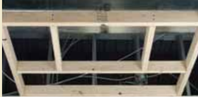
1. Frame the opening.