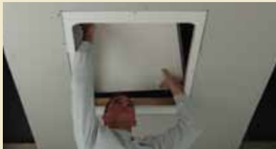
3. Install drywall and place access panel in opening.