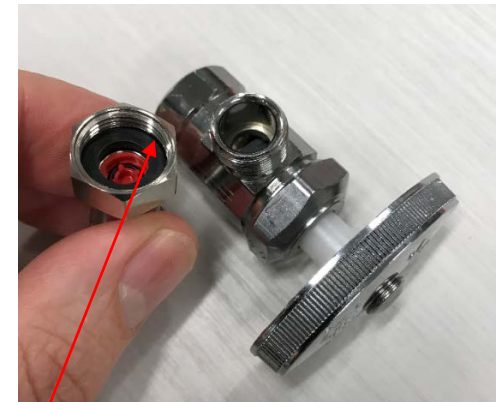
Fig. 3 Flat rubber seal inside female side of NEOPERL SLA

The female thread side of the NEOPERL SLA is intended to connect directly to a 3/8" compression angle stop valve (fig. 1)