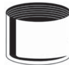
Regular Female VP