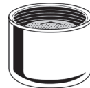
Small Female VP