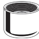
Small Female VP