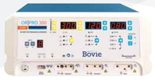
3350 - OR|PRO 300

Feature: The dual monopolar ports allow two surgeons to work simultaneously in the spray coagulation setting.