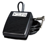
A803 Footswitch †