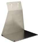
A813 Table Top Stand †