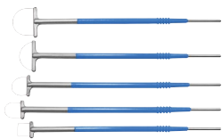
Lletz Loop Electrodes †