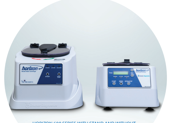
HORIZON 600 SERIES WITH STAND AND WITHOUT