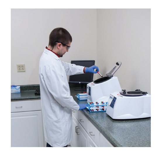
PHYSICIAN'S OFFICES & RESEARCH LABS