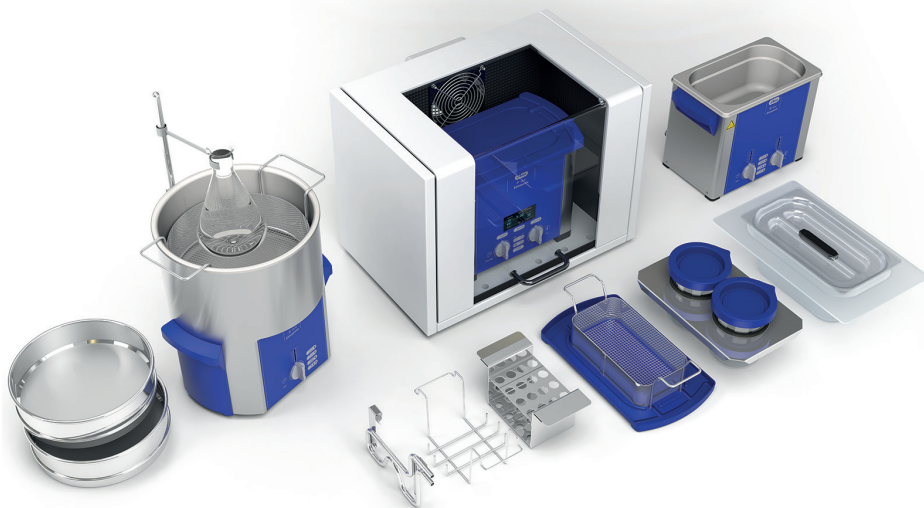
Elmasonic S and Elmasonic P with accessories

In the event of questions or a warranty claim please contact our technical support under: support@elma-ultrasonic.com or +49 7731 882-280