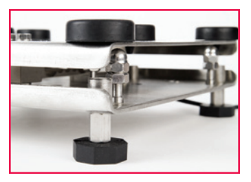
No Threads Visible Assures conformance to Food Safety standards and minimized contamination areas.