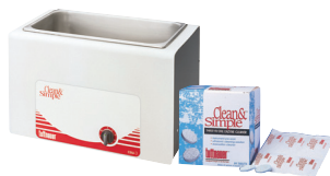
Clean&Simple™ Ultrasonic Cleaners and Tablets

Documents: date, time, temperature, pressure.