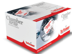
Chamber Brite Autoclave Cleaner