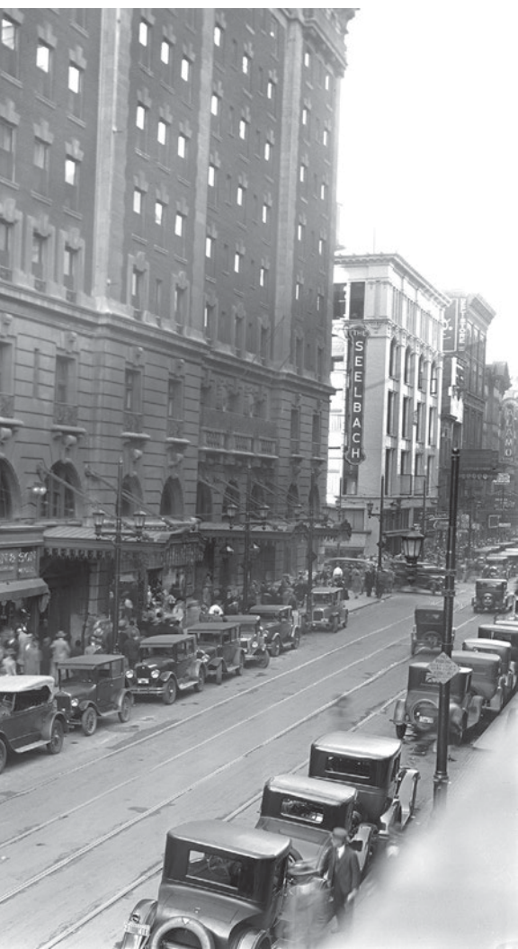
■ The Seelbach Hotel, Fourth Street, 1927