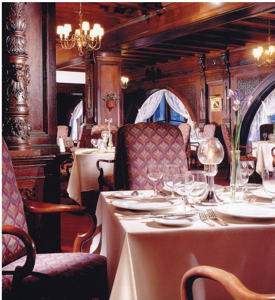
■ The Oakroom